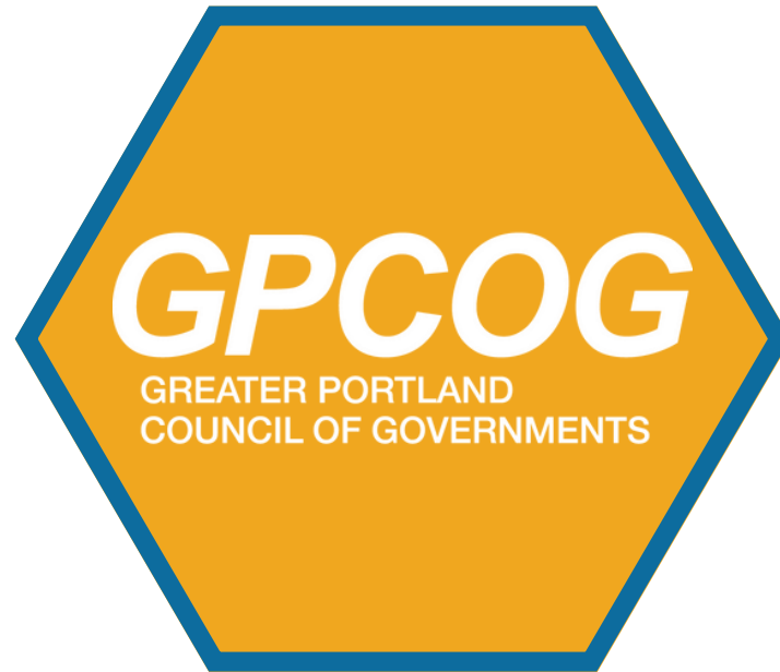
Greater Portland Council of Governments Cumberland County