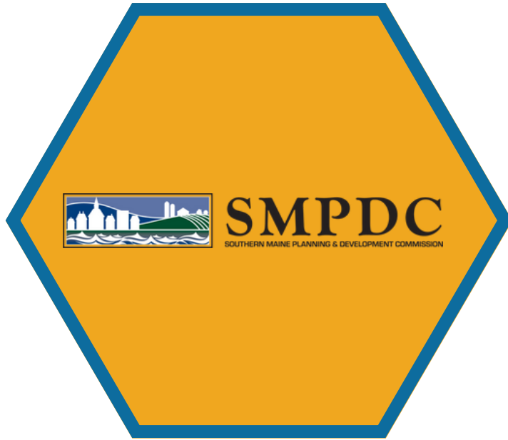
Southern Maine Planning & Development Commission Southern Maine