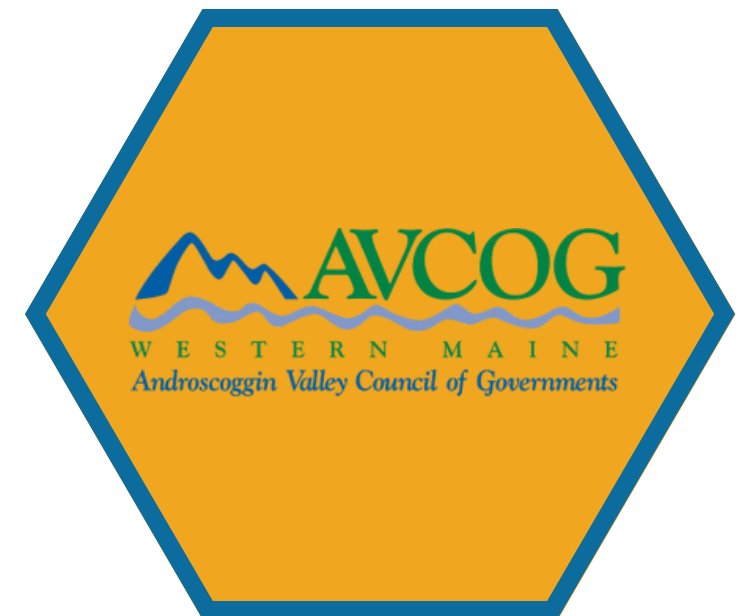
Androscoggin Valley Council of Governments Western Maine