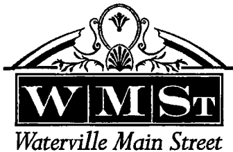
Paul R. LePage Mayor

177 Main Street, Waterville, Maine 04901 TEL 207.680.2055 FAX 207.680.2056 info@watervillemainstreet.org www.watervillemainstreet.org